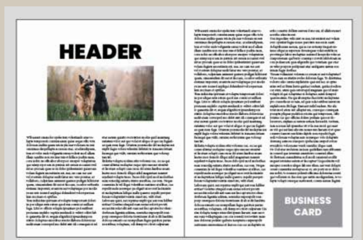
BUSINESS CARD -- 3.5" x 2"