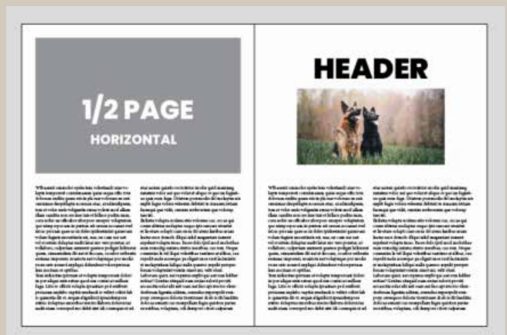
1/2 PAGE horizontal 7.5" x 4.9375"