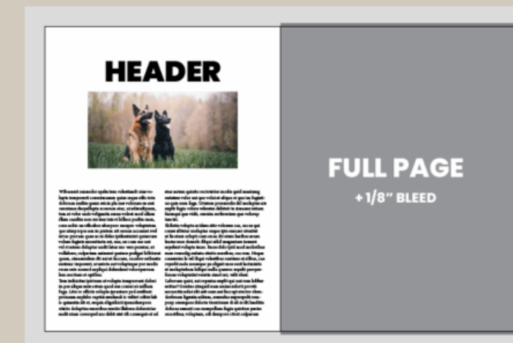
FULL PAGE SPREAD with bleed 8.625" x 11.25"