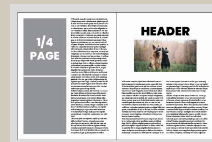
1/4 PAGE -- 3.6875" x 4.9375"