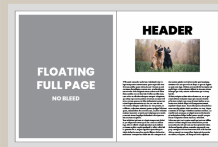
FLOATING FULL PAGE no bleed 7.875" x 10.375"

Critical graphic elements and important text should be kept out of the gutter for 2 page spreads.