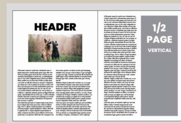
1/2 PAGE vertical 3.6875" x 10"