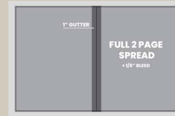
2 PAGE SPREAD with bleed 17.25" x 11.25"

Critical graphic elements and important text should be kept out of the gutter for 2 page spreads.