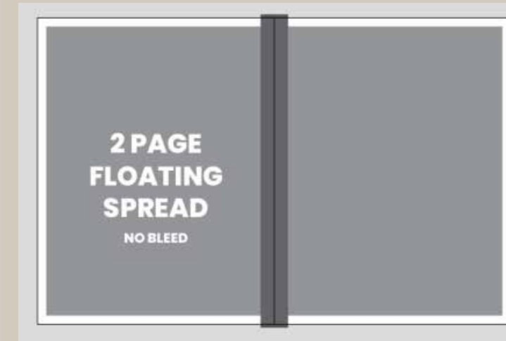
2 PAGE FLOATING SPREAD no bleed 16.375" x 12.375"